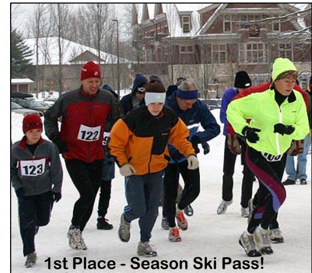
1st Place - Season Ski Pass!